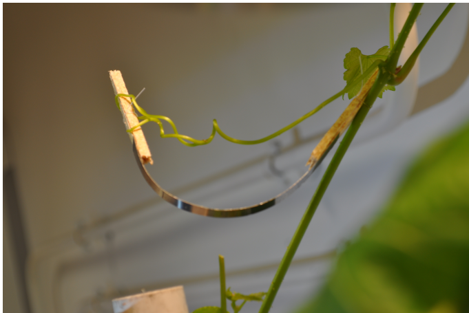
Figure 2: Prototype for traction at constant force

Proposed agenda In order to answer these questions, we propose to combine experimental and theoretical work, with the following steps: